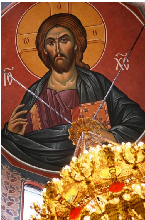
Dome section - Christ The Pantocrator