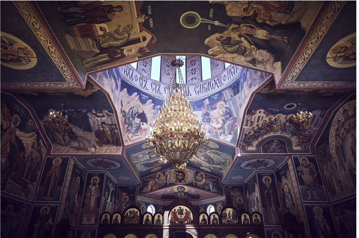
Church Interior completely frescoed, commenced February 2006 and Consecrated on the 23 rd October 2010.